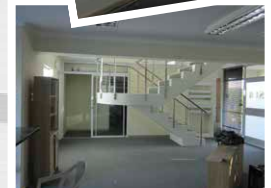
New Doors for the Finance Department

Reference: Your name "Office Renovation Fund"