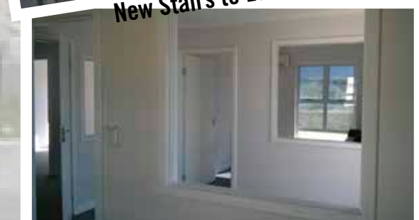
New Offices Upstairs