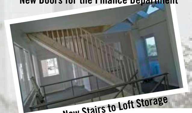
New Stairs to Loft Storage